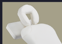
Face Cradle & Arm Support Set