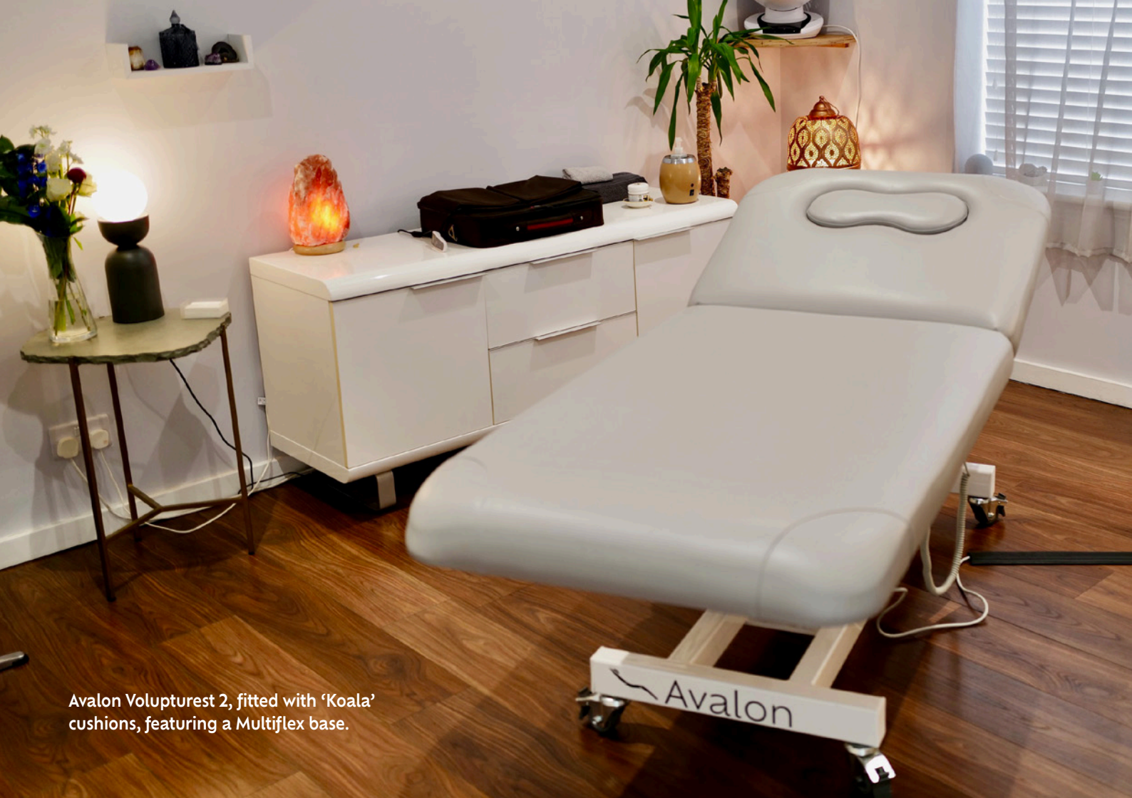
Avalon Voluptrest 2, fitted with 'Koala' cushions, featuring a Multiflex base.