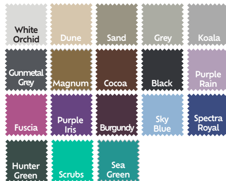
Fabric samples available upon request

The available options feature core elements, including a face hole and plug, side arms and face cradle attachments, through to more personal preferences such as the aesthetics of colour and style. Every Avalon couch is carefully crafted in the UK ensuring each option enhances its performance for you, and its visual, sensual, and practical experience for your clients.